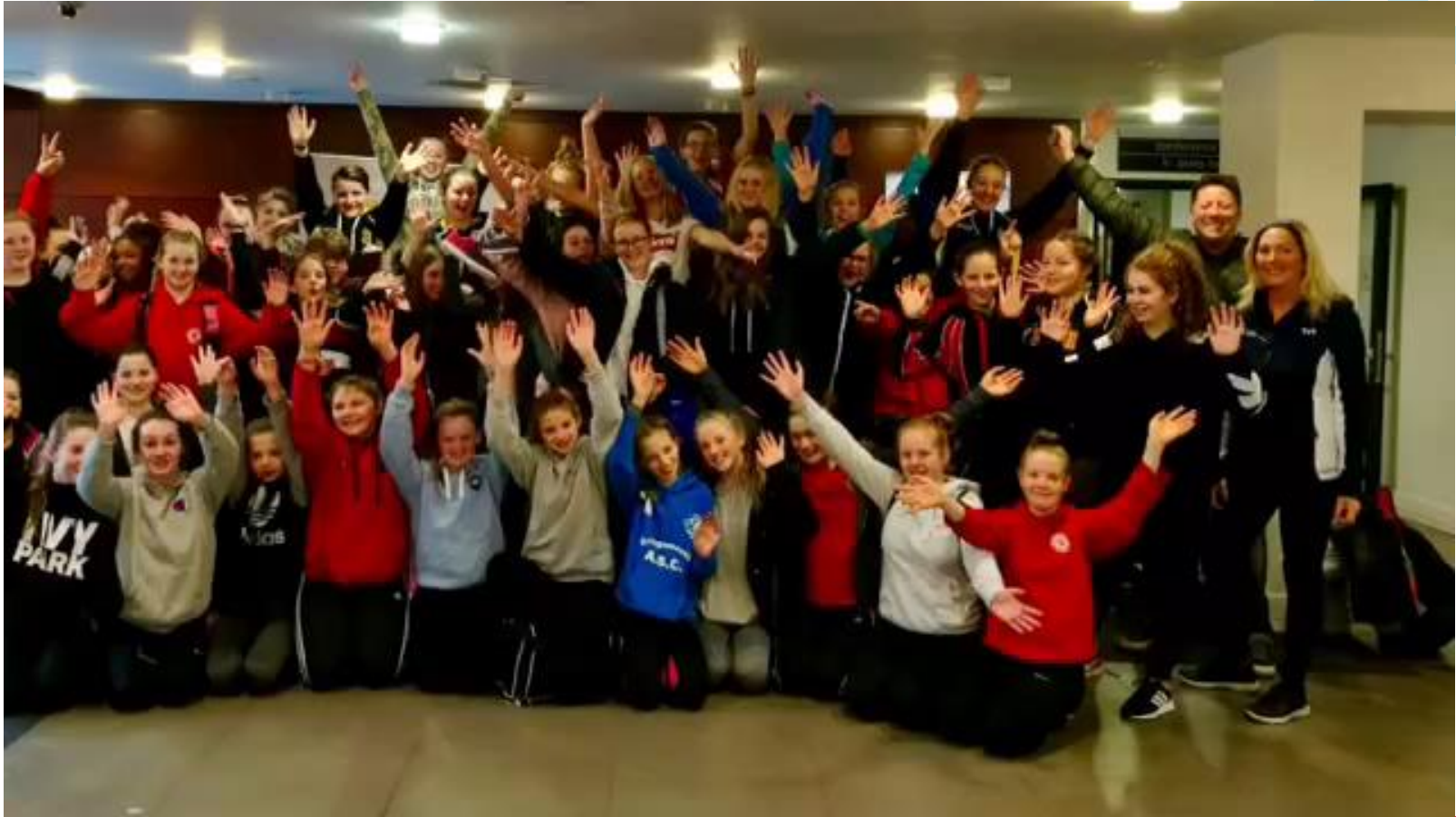
Girls Development U16 & U14 Camp Nov 10-11, 2018